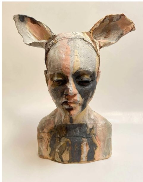
Nicole Merkens, “another Birthday” Glazed Clay Size: 14”h x 11”w x 8”d