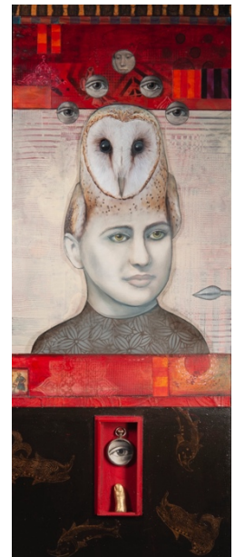
Janet O’Neal, “Minerva” Mixed media on wood Size: 40” x 16”