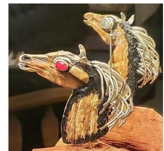
Horsehead Brooch & Mini Sculpture – mixed media

"You can get ideas by sitting outside – there's so much activity that others may see. You can get ideas from looking in any place, she said." (Continued pg 4)