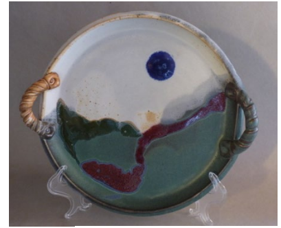
Ceramic plate by John Segell

As always, 20% of art sales during the exhibits benefits Vista Grande Public Library, a 501(c)(3) nonprofit serving Southeastern Santa Fe County with programs and material collections for adults and teens.