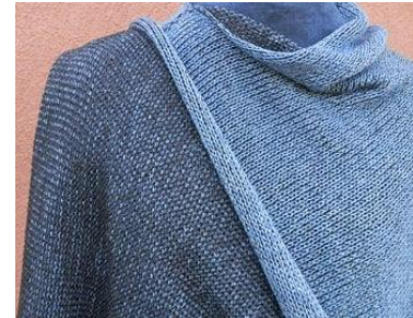
Bobbie Sumberg, fine knitwear using natural fibers