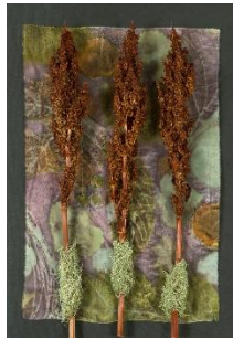
Roxanne Turner, eco-printed silks with native plants

For information, contact Roxanne at 503-468-9432 or Lucinda at 505-920-7997