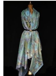
Lucinda Folsom, botanical prints and eco-dyed wearables