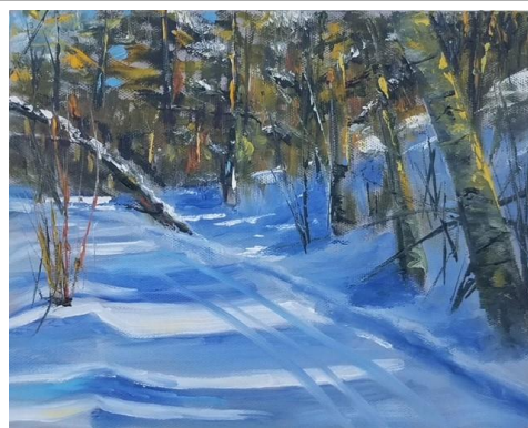
"Skier's Trail Big Tesuque"